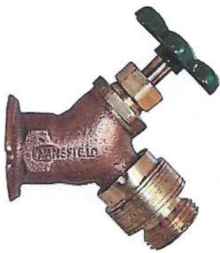
Installed vacuum breaker